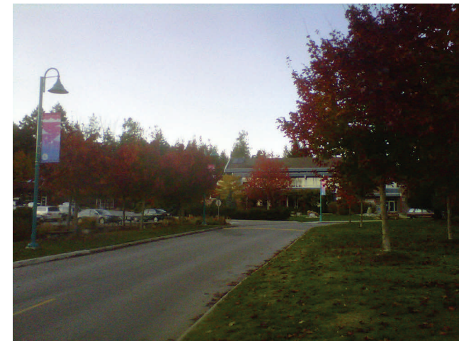
Red Maple Trees ( Acer rubrum ) along Rosina Giles Way